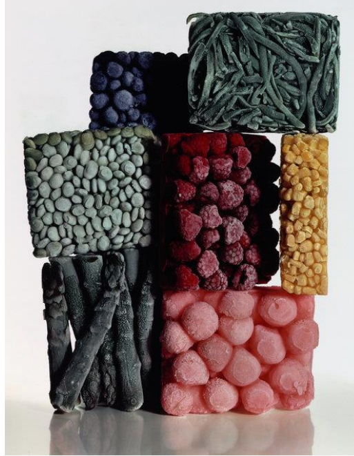
I just like this for its complete originality.

Frozen Foods with String Beans, New York, 1977